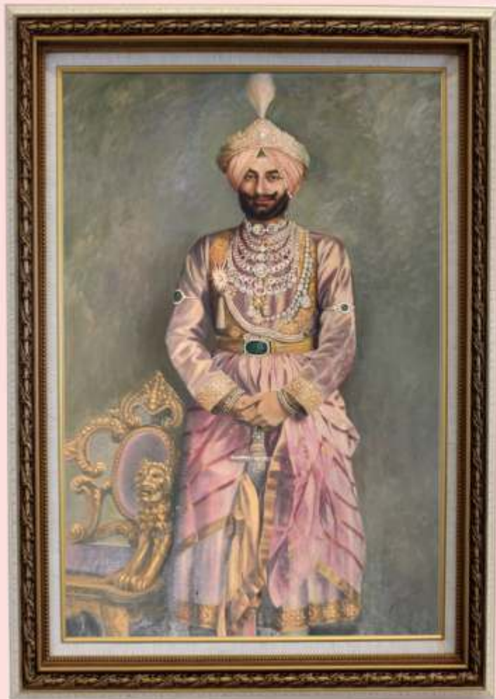
Our Founder HIS HIGHNESS MAHARAJADHIRAJ YADAVINDRA SINGH MOHINDRA BAHADUR OF PATIALA (07.01.1913 - 17.06.1974)